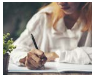
Tutor: Colette Lawler

To apply visit lmc.ac.uk/part-time/community