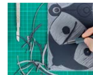
Tutor: Sam Pickett

To apply visit lmc.ac.uk/part-time/community