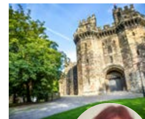
Tutor: Amanda Forshaw

To apply visit lmc.ac.uk/part-time/community