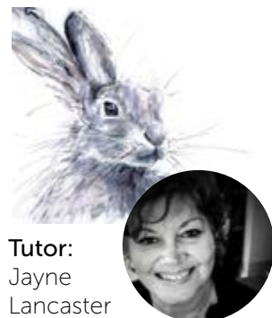
Tutor: Jayne Lancaster

To apply visit lmc.ac.uk/part-time/community