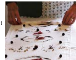
Tutor: Sam Pickett

To apply visit lmc.ac.uk/part-time/community